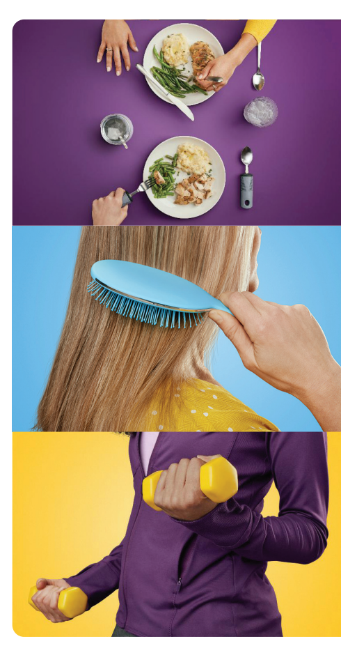
Models are not actual patients

It's important to take AUSTEDO exactly as prescribed by your doctor. Be sure to ask your doctor or pharmacist if you have any questions about prescription instructions or the titration process.